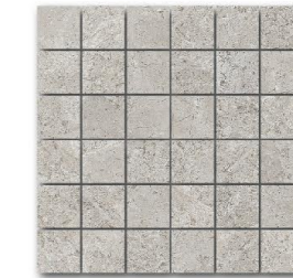
SQUARE ▲ +/- 30x30