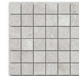
SQUARE ▲ +- 30x30