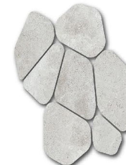
ROCK ▲ +- 30x41