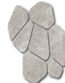
ROCK ▲ +/- 30x41