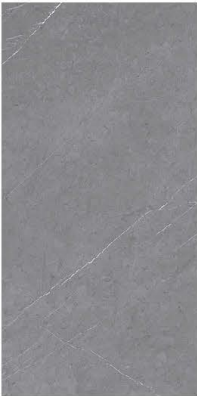
FP12606 ► 60x120 ► matt