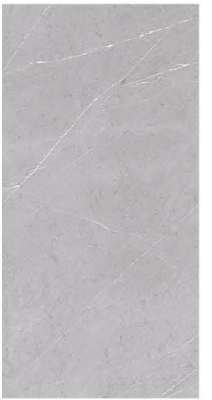
FP12605 ► 60x120 ► matt