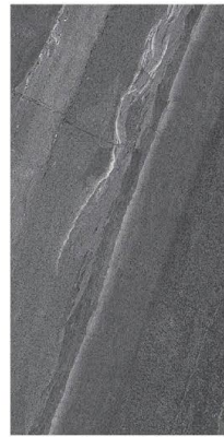
SY12617 ► 60x120 ► matt