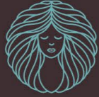
PIEDRA stone collections