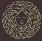
MADERA wood collections