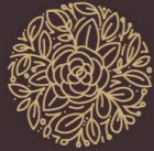
FIORA flowery collections