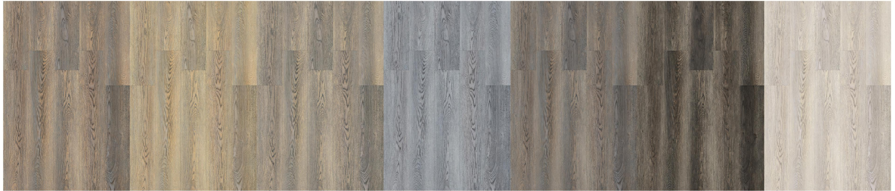
MADERA FROS 02 Taupe FROS 5601